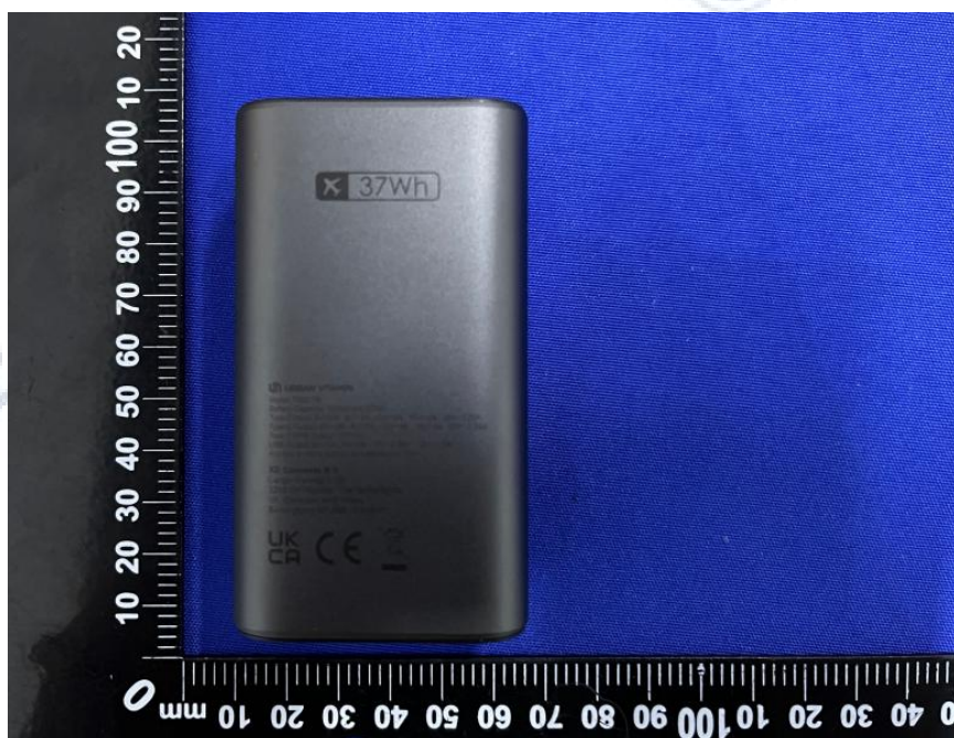
Photo 2 反面 Rear

Model: P322.76 Battery Capacity: 10000mAh/37Wh Type C Input: 5V-3A 9V-3A 12V-3A 15V-3A 20V-2.25A Type C Output: 5V-3A 9V-3A 12V-3A 15V-3A 20V-2.25A Type C PPS Output: 11V-5A USB Output: 5V-3A 9V-2A 10V-2.25A 12V-1.5A Any two or more outputs simultaneously: 15W