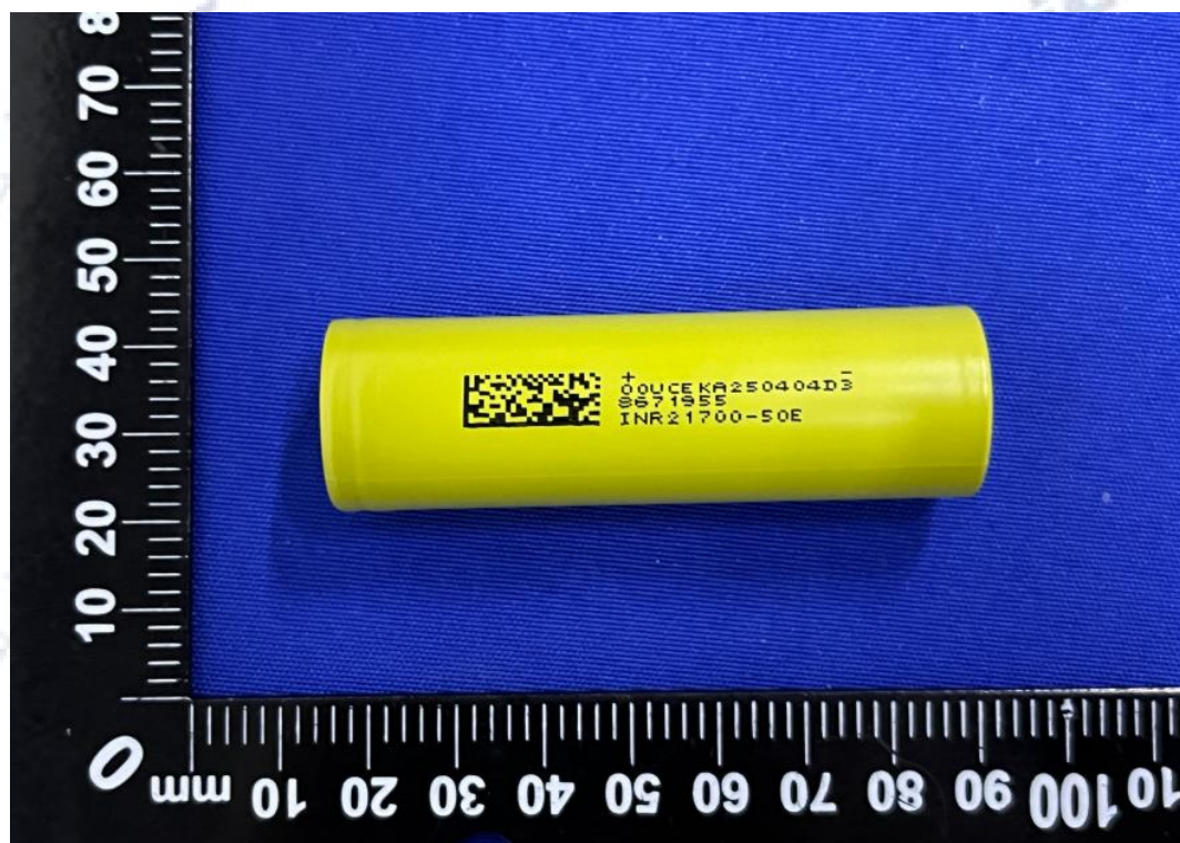
Photo 4 内部电芯 Internal Cell