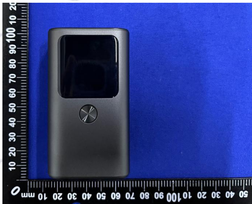
Photo 1 正面 Front

Model: P322.76 Battery Capacity: 10000mAh/37Wh Type C Input: 5V-3A 9V-3A 12V-3A 15V-3A 20V-2.25A Type C Output: 5V-3A 9V-3A 12V-3A 15V-3A 20V-2.25A Type C PPS Output: 11V-5A USB Output: 5V-3A 9V-2A 10V-2.25A 12V-1.5A Any two or more outputs simultaneously: 15W